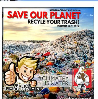
Recycle Your Trash

But cleanups don't actually solve the problem, do they? That's true, and that is why we also have many other initiatives to stop plastic pollution at the source - to help "turn off the tap". However, cleanups remain an excellent, hands-on education tool for communities that are often not aware of the harm done by plastic to the ocean and to our health, nor that it is in their power to do something about it. Even in countries where the issues are known, activities such as waste and brand audits of the trash collected can be eye-opening for many people.