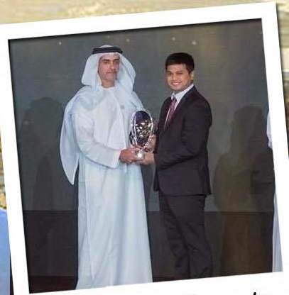
Ju Jitsu Development