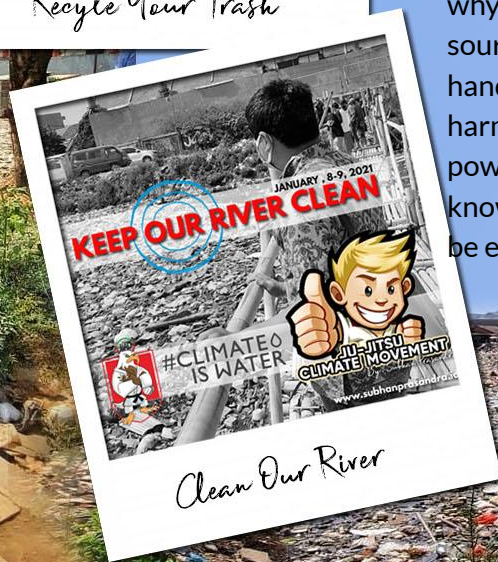
Clean Our River